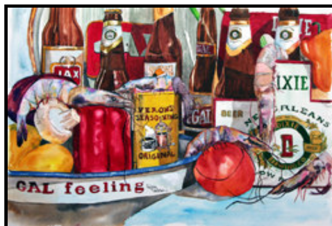
1010 Shrimp, Veron's and beer