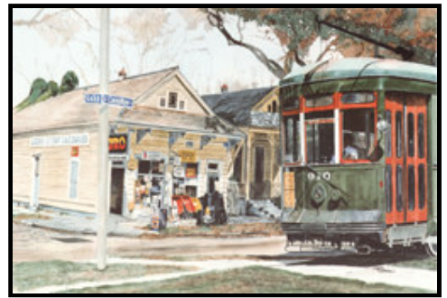
8108 New Orleans Streetcar