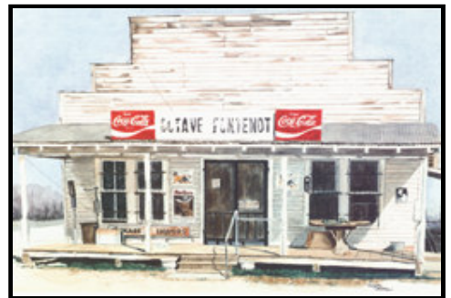
8111 Octave Fontenot