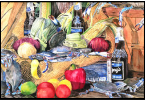
8538 Crabs and Root Beer*

* denotes cropped artwork is available in following products FC= Foam Coaster $2.50 CC= Can Hugger $4.99