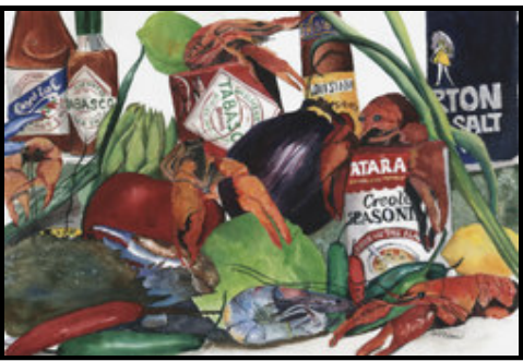
8131 Spices and Vegetables*