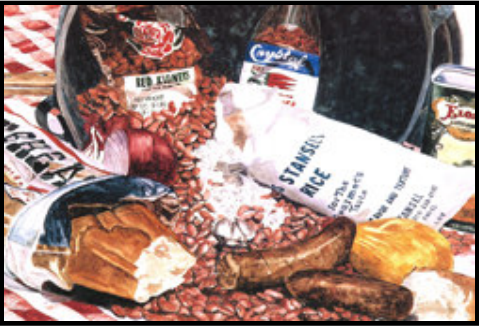
8536 Red Beans and Rice