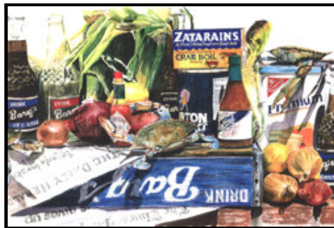
1008 Crab in the middle*