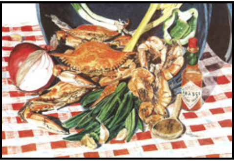
8537 Crab and Shrimp Boil