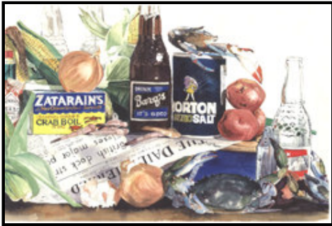
1002 Root Beer and spices*