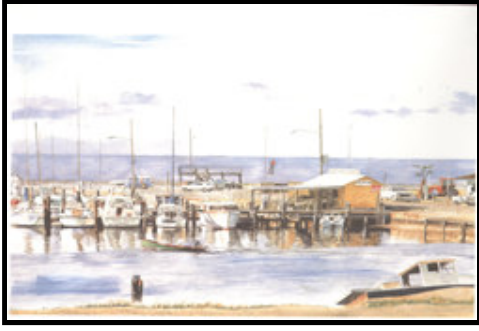
1006 Bait Shop in the Pass