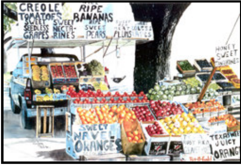
8054 Fruit Stand