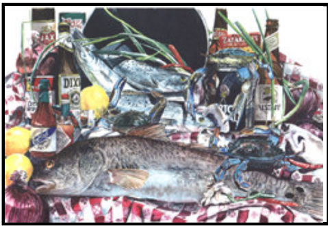
1001 Fish and Beers*