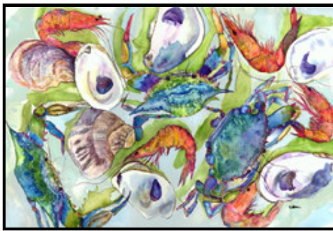
8547 Jubilee #2*