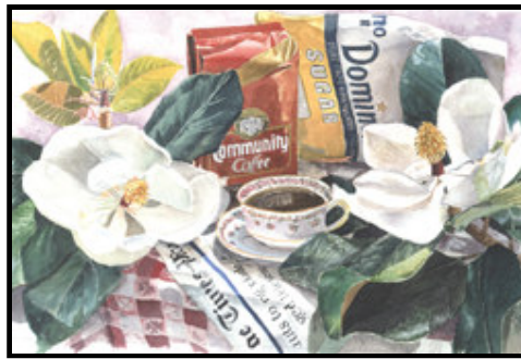
1005 Coffee Time*