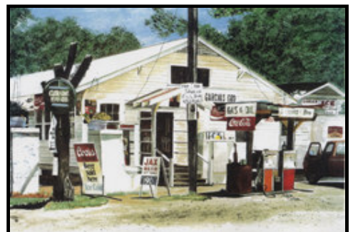
8130 Garcias Grocery

caroline's Treasures & the-store.com 1301 Azalea Road Mobile, AL 36693