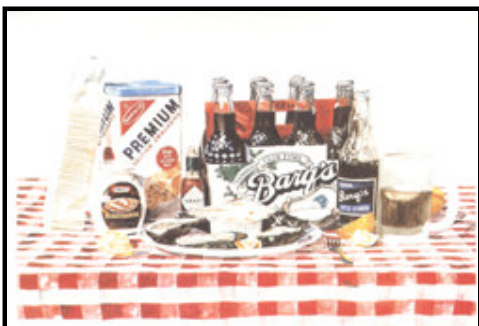
1004 Oysters and Crackers*