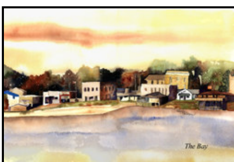
8121 The Bay