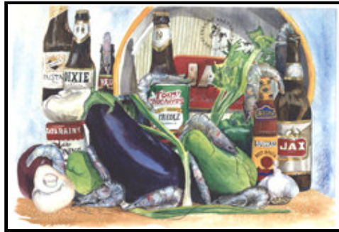
1007 Eggplant and Beers*